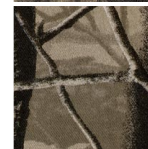
Real Tree Hardwoods